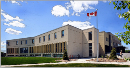
Smiths Falls Site