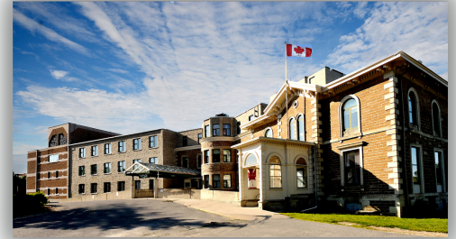
Perth (GWM) Site

The Perth and Smiths Falls District Hospital (PSFDH) strives to be the hospital of choice for residents and is committed to excellence in a patient and family-centred care environment and to the promotion of wellness and health.